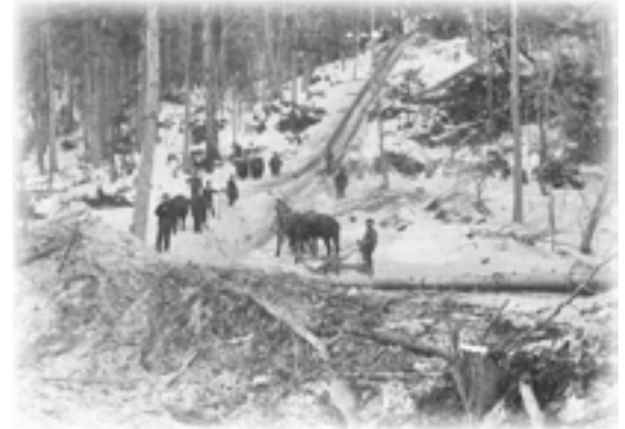
Winter logging, North Grantham, early 20th century